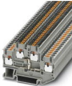
Double-level terminal block, Cross section: 0.14 mm 2 - 4 mm 2 , AWG: 26 - 12, Connection type: Push-in connection, Width: 5.2 mm, Color: gray, Mounting type: NS 35/7,5, NS 35/15

Please be informed that the data shown in this PDF Document is generated from our Online Catalog. Please find the complete data in the user's documentation. Our General Terms of Use for Downloads are valid ( http://download.phoenixcontact.com )