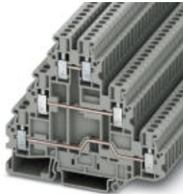
Multi-level terminal block, Cross section: 0.14 mm 2 - 4 mm 2 , AWG: 26 - 12, Connection type: Screw connection, Width: 5.2 mm, Color: gray, Mounting type: NS 35/7,5, NS 35/15

Please be informed that the data shown in this PDF Document is generated from our Online Catalog. Please find the complete data in the user's documentation. Our General Terms of Use for Downloads are valid ( http://download.phoenixcontact.com )