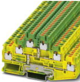
Ground modular terminal block, Connection method: Push-in connection, Cross section: 0.14 mm 2 - 4 mm 2 , AWG: 26 - 12, Width: 5.2 mm, Color: green-yellow, Mounting type: NS 35/7,5, NS 35/15

Please be informed that the data shown in this PDF Document is generated from our Online Catalog. Please find the complete data in the user's documentation. Our General Terms of Use for Downloads are valid ( http://download.phoenixcontact.com )