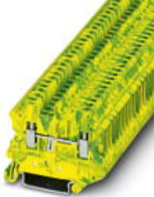
Feed-through terminal block, Connection method: Screw connection, Cross section: 0.14 mm 2 - 4 mm 2 , AWG: 26 - 12, Width: 5.2 mm, Color: green-yellow, Mounting type: NS 35/7,5, NS 35/15

Please be informed that the data shown in this PDF Document is generated from our Online Catalog. Please find the complete data in the user's documentation. Our General Terms of Use for Downloads are valid ( http://download.phoenixcontact.com )