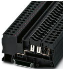
Fuse terminal block with LED for mounting on NS 35, for miniature circuit breakers, terminal width: 8.2 mm, color: Black

Please be informed that the data shown in this PDF Document is generated from our Online Catalog. Please find the complete data in the user's documentation. Our General Terms of Use for Downloads are valid ( http://download.phoenixcontact.com )