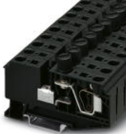
Spring-cage terminal block-fuse terminal block for cartridge fuse inserts with screw cap, cross section: 0.5 - 6 mm 2 , width: 12 mm, color: black

Please be informed that the data shown in this PDF Document is generated from our Online Catalog. Please find the complete data in the user's documentation. Our General Terms of Use for Downloads are valid ( http://download.phoenixcontact.com )