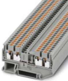
Feed-through terminal block, Connection method: Push-in connection, Cross section: 0.14 mm 2 - 4 mm 2 , AWG: 26 - 12, Width: 5.2 mm, Height: 35.3 mm, Color: gray, Mounting type: NS 35/7,5, NS 35/15

Please be informed that the data shown in this PDF Document is generated from our Online Catalog. Please find the complete data in the user's documentation. Our General Terms of Use for Downloads are valid ( http://download.phoenixcontact.com )