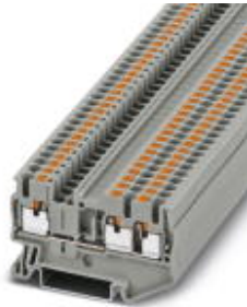
Feed-through terminal block, Connection method: Push-in connection, Cross section: 0.14 mm 2 - 4 mm 2 , AWG: 26 - 12, Width: 5.2 mm, Height: 35.2 mm, Color: gray, Mounting type: NS 35/7,5, NS 35/15

Please be informed that the data shown in this PDF Document is generated from our Online Catalog. Please find the complete data in the user's documentation. Our General Terms of Use for Downloads are valid ( http://download.phoenixcontact.com )