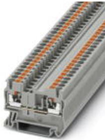
Feed-through terminal block, Connection method: Push-in connection, Cross section: 0.14 mm 2 - 4 mm 2 , AWG: 26 - 12, Width: 5.2 mm, Height: 35.3 mm, Color: gray, Mounting type: NS 35/7,5, NS 35/15

Please be informed that the data shown in this PDF Document is generated from our Online Catalog. Please find the complete data in the user's documentation. Our General Terms of Use for Downloads are valid ( http://download.phoenixcontact.com )