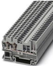
Feed-through terminal block, Connection method: Spring-cage/plug-in connection, Cross section: 0.08 mm 2 - 4 mm 2 , AWG: 28 - 12, Width: 5.2 mm, Color: gray, Mounting type: NS 35/7,5, NS 35/15

Please be informed that the data shown in this PDF Document is generated from our Online Catalog. Please find the complete data in the user's documentation. Our General Terms of Use for Downloads are valid ( http://download.phoenixcontact.com )