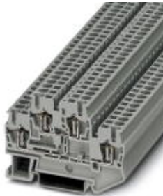
Double-level spring-cage terminal block, Cross section: 0.08 mm 2 - 4 mm 2 , AWG: 28 - 12, Connection type: Spring-cage connection, Width: 5.2 mm, Color: gray, Mounting type: NS 35/7,5, NS 35/15

Please be informed that the data shown in this PDF Document is generated from our Online Catalog. Please find the complete data in the user's documentation. Our General Terms of Use for Downloads are valid ( http://download.phoenixcontact.com )