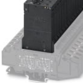
Thermomagnetic circuit breaker, 2-pos., normal blow, 1 N/O contact and 1 N/C contact

Please be informed that the data shown in this PDF Document is generated from our Online Catalog. Please find the complete data in the user's documentation. Our General Terms of Use for Downloads are valid ( http://download.phoenixcontact.com )