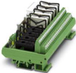
VARIOFACE output module, with plug-in bases for 8 miniature relays, with 2 PDTs each (without relays), for 24 V DC

Please be informed that the data shown in this PDF Document is generated from our Online Catalog. Please find the complete data in the user's documentation. Our General Terms of Use for Downloads are valid ( http://download.phoenixcontact.com )