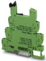
6.2 mm PLC basic terminal blocks with screw connection, 24 V DC input voltage (without relay or optocoupler)

Please be informed that the data shown in this PDF Document is generated from our Online Catalog. Please find the complete data in the user's documentation. Our General Terms of Use for Downloads are valid ( http://download.phoenixcontact.com )