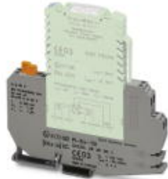
Ex base terminal block for intrinsically safe signals with knife disconnection and test connections

Please be informed that the data shown in this PDF Document is generated from our Online Catalog. Please find the complete data in the user's documentation. Our General Terms of Use for Downloads are valid ( http://download.phoenixcontact.com )