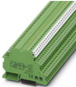
Relay terminal block, with soldered-in miniature relays, contact (AgNi+Au): small to medium loads, 1 N/O contact, input voltage 24 V AC/DC, for assembly on NS 35/7.5, terminal width 6.2 mm

Please be informed that the data shown in this PDF Document is generated from our Online Catalog. Please find the complete data in the user's documentation. Our General Terms of Use for Downloads are valid ( http://download.phoenixcontact.com )