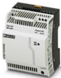
Primary-switched STEP POWER power supply for DIN rail mounting, input: 1-phase, output: 5 V DC/6.5 A

Please be informed that the data shown in this PDF Document is generated from our Online Catalog. Please find the complete data in the user's documentation. Our General Terms of Use for Downloads are valid ( http://phoenixcontact.com/download )