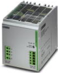
DIN rail power supply unit, primary-switched mode, three-phase, output: 24 V DC / 20 A

Please be informed that the data shown in this PDF Document is generated from our Online Catalog. Please find the complete data in the user's documentation. Our General Terms of Use for Downloads are valid ( http://download.phoenixcontact.com )