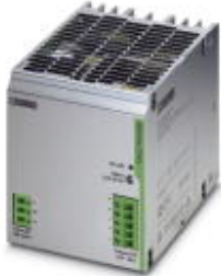
DIN rail power supply unit, primary-switched mode, 1-phase, output: 24 V DC / 20 A

Please be informed that the data shown in this PDF Document is generated from our Online Catalog. Please find the complete data in the user's documentation. Our General Terms of Use for Downloads are valid ( http://download.phoenixcontact.com )