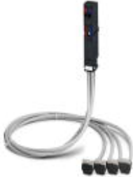
VIP VARIOFACE front adapter, with connected system cables for SMATIC S7-300, 4 x 8 channels can be connected, cable length: 0.5 m

Please be informed that the data shown in this PDF Document is generated from our Online Catalog. Please find the complete data in the user's documentation. Our General Terms of Use for Downloads are valid ( http://download.phoenixcontact.com )