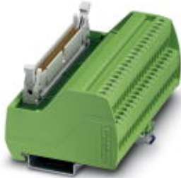
VARIOFACE interface module for Siemens SIMATIC® S7-300, with SIMATIC®-specific labeling (1 - 40), with screw connection, module width: 106.1 mm

Please be informed that the data shown in this PDF Document is generated from our Online Catalog. Please find the complete data in the user's documentation. Our General Terms of Use for Downloads are valid ( http://download.phoenixcontact.com )