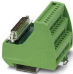
VARIOFACE module, with screw connection and male D-Subminiature pin strip, for mounting on NS 35 rails, 25-pos.

Please be informed that the data shown in this PDF Document is generated from our Online Catalog. Please find the complete data in the user's documentation. Our General Terms of Use for Downloads are valid ( http://download.phoenixcontact.com )