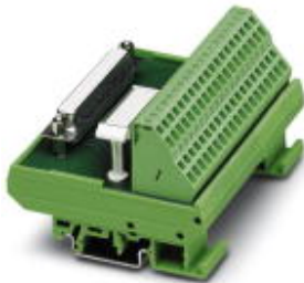
Standard 1:1 D-SUB module, with spring-cage connection and D-SUB socket strip, no. of positions 37

Please be informed that the data shown in this PDF Document is generated from our Online Catalog. Please find the complete data in the user's documentation. Our General Terms of Use for Downloads are valid ( http://download.phoenixcontact.com )