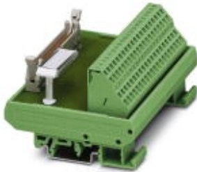
Standard 1:1 FLK module, with spring-cage connection and flat-ribbon cable connector, no. of positions 20

Please be informed that the data shown in this PDF Document is generated from our Online Catalog. Please find the complete data in the user's documentation. Our General Terms of Use for Downloads are valid ( http://download.phoenixcontact.com )