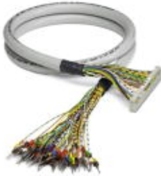
Round cable assembled with a 20-pos. socket strip and an open end. On the open end, the wires are labeled with 1 to 20 and have ferrules, cable length: 2 m

Please be informed that the data shown in this PDF Document is generated from our Online Catalog. Please find the complete data in the user's documentation. Our General Terms of Use for Downloads are valid ( http://download.phoenixcontact.com )