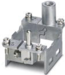
HEAVYCON hinged retaining frame, for HC-B 6 sleeve housing, for 2 modules, labeling with upper case letters (A, B)

Please be informed that the data shown in this PDF Document is generated from our Online Catalog. Please find the complete data in the user's documentation. Our General Terms of Use for Downloads are valid ( http://download.phoenixcontact.com )