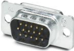
D-SUB contact insert, shell size 1, with 15 signal contacts, contact type pin, with solder cup, straight, fixing with a 3 mm hole, for panel mounting frame VS-09-...

Please be informed that the data shown in this PDF Document is generated from our Online Catalog. Please find the complete data in the user's documentation. Our General Terms of Use for Downloads are valid ( http://download.phoenixcontact.com )