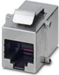
RJ45 socket insert, modular (Keystone), CAT5e, 8-pos., shielded, socket on socket

Please be informed that the data shown in this PDF Document is generated from our Online Catalog. Please find the complete data in the user's documentation. Our General Terms of Use for Downloads are valid ( http://download.phoenixcontact.com )