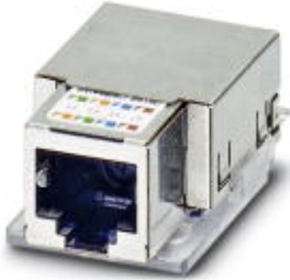
RJ45 socket insert, for the Freetnet system, CAT6, 8-pos., shielded, with cable connection (IDC fast connection), for litz and solid wires AWG 24 ... 22

Please be informed that the data shown in this PDF Document is generated from our Online Catalog. Please find the complete data in the user's documentation. Our General Terms of Use for Downloads are valid ( http://download.phoenixcontact.com )