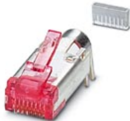
RJ45 male insert, CAT6, 8-pos., shielded, IDC displacement connection, for litz wire AWG 25 ... 24 and solid wires AWG 24, with strain relief

Please be informed that the data shown in this PDF Document is generated from our Online Catalog. Please find the complete data in the user's documentation. Our General Terms of Use for Downloads are valid ( http://download.phoenixcontact.com )