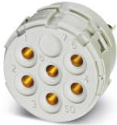
Contact insert, Number of positions: 12, Type of contact: Socket, Solder connection

Please be informed that the data shown in this PDF Document is generated from our Online Catalog. Please find the complete data in the user's documentation. Our General Terms of Use for Downloads are valid ( http://download.phoenixcontact.com )