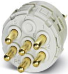
Contact insert, Number of positions: 12, Type of contact: Male connector, Solder connection

Please be informed that the data shown in this PDF Document is generated from our Online Catalog. Please find the complete data in the user's documentation. Our General Terms of Use for Downloads are valid ( http://download.phoenixcontact.com )