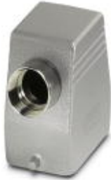
HEAVYCON sleeve housing B6, for single locking latch, height 72 mm, with support 1x M20, lateral conductor exit

Please be informed that the data shown in this PDF Document is generated from our Online Catalog. Please find the complete data in the user's documentation. Our General Terms of Use for Downloads are valid ( http://download.phoenixcontact.com )