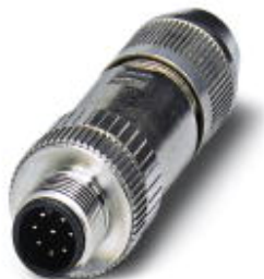
Bus system connector, Ethernet CAT5, Ethernet CAT5e, 8-position, shielded, Plug straight M12, A-coded, Insulation displacement connection, Knurl material: Zinc die-cast, nickel-plated, External cable diameter 4 mm ... 8 mm

Please be informed that the data shown in this PDF Document is generated from our Online Catalog. Please find the complete data in the user's documentation. Our General Terms of Use for Downloads are valid ( http://download.phoenixcontact.com )