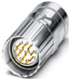
Cable connector, straight, shielded, Screw locking, M23, Number of positions: 12, Type of contact: Male connector, Solder connection, Cable diameter: 3 mm...14.5 mm

Please be informed that the data shown in this PDF Document is generated from our Online Catalog. Please find the complete data in the user's documentation. Our General Terms of Use for Downloads are valid ( http://download.phoenixcontact.com )