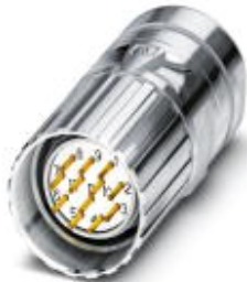
Cable connector, straight, shielded, Screw locking, M23, Number of positions: 16+3, Type of contact: Male connector, Solder connection, Cable diameter: 3 mm...14.5 mm

Please be informed that the data shown in this PDF Document is generated from our Online Catalog. Please find the complete data in the user's documentation. Our General Terms of Use for Downloads are valid ( http://download.phoenixcontact.com )