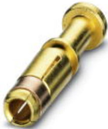
Crimp contact, turned, Single contact, Contact diameter: 2 mm, Crimp range: 1 mm 2 ...2.5 mm 2

Please be informed that the data shown in this PDF Document is generated from our Online Catalog. Please find the complete data in the user's documentation. Our General Terms of Use for Downloads are valid ( http://download.phoenixcontact.com )