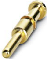
Crimp contact, turned, Single contact, Contact diameter: 2 mm, Crimp range: 1 mm 2 ...2.5 mm 2

Please be informed that the data shown in this PDF Document is generated from our Online Catalog. Please find the complete data in the user's documentation. Our General Terms of Use for Downloads are valid ( http://download.phoenixcontact.com )