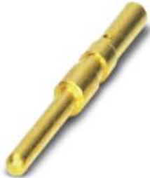
Crimp contact, diameter 1 mm, for all 3 to 5-pos. contact inserts, crimp range from 0.08 mm 2 - 0.34 mm 2 .

Please be informed that the data shown in this PDF Document is generated from our Online Catalog. Please find the complete data in the user's documentation. Our General Terms of Use for Downloads are valid ( http://download.phoenixcontact.com )