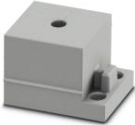
Small, slotted cable sleeves suitable for cables with a diameter of 5 ... 6 mm, material: SEBS

Please be informed that the data shown in this PDF Document is generated from our Online Catalog. Please find the complete data in the user's documentation. Our General Terms of Use for Downloads are valid ( http://download.phoenixcontact.com )