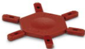
Coding profile, Number of positions: 1, Color: red

Please be informed that the data shown in this PDF Document is generated from our Online Catalog. Please find the complete data in the user's documentation. Our General Terms of Use for Downloads are valid ( http://download.phoenixcontact.com )