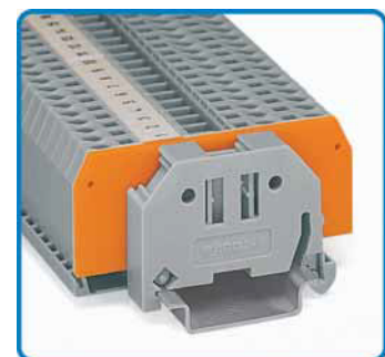
... that's it!