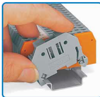
Snap on ...

A further advantage is that three marker receptacles for all WAGO marker systems for rail-mount terminal blocks and a snap-in hole for WAGO adjustable height group marker carriers offer individual marking possibilities.