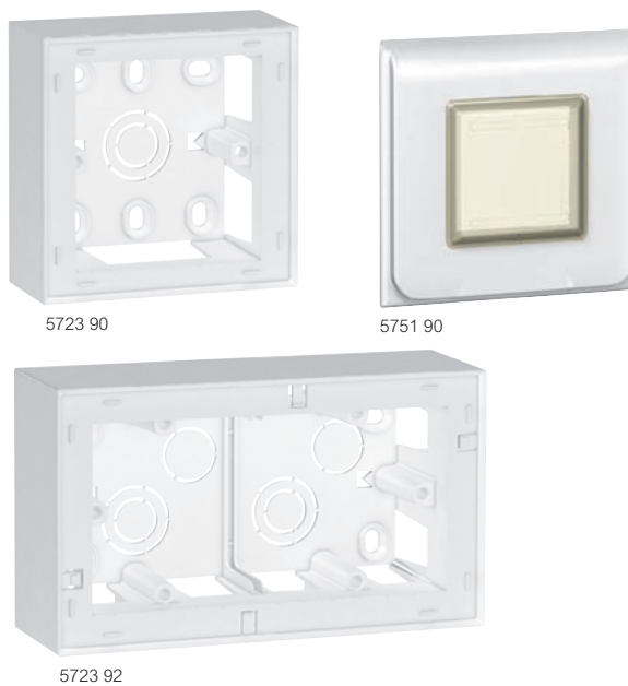
Support frames and plates selection charts p. 134-137