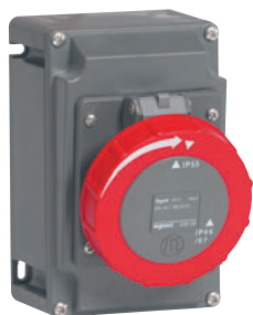
0530 50 + 0529 40

Technical information and dimensions (p. 183-185) Conformity to International Standards (p. 204)