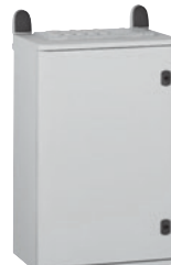
0362 55 + wall brackets Cat. No. 0364 09