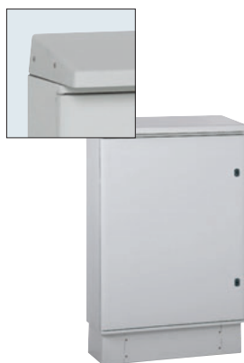
0362 63 + plinth Cat. No. 0362 92 + roof Cat. No. 0362 95