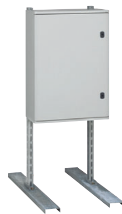
0362 56 on stand Cat. No. 0364 36 and crosspieces Cat. No. 0364 39

Technical information and dimensions (p. 19-20) Equipment (p. 23-32)