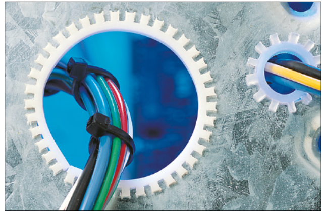
Optimal protection of cables and wires at panel edges.