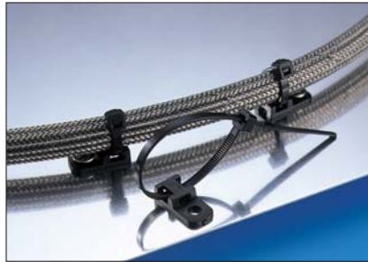
Cable Tie Mounts CTAM.

Each of these products offer particular benefits, but all are designed for simple, yet robust, installation in a wide variety of applications. Particularly used in telecoms equipment, switchgear and control cabinets.