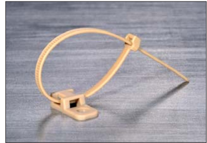
Peek Fixing solution PEEK containing of CTAM und PT2A.